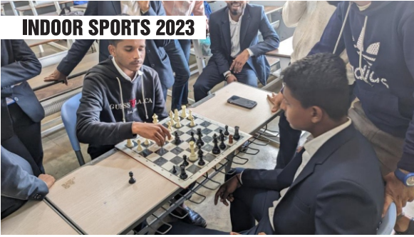
INDOOR SPORTS 2023