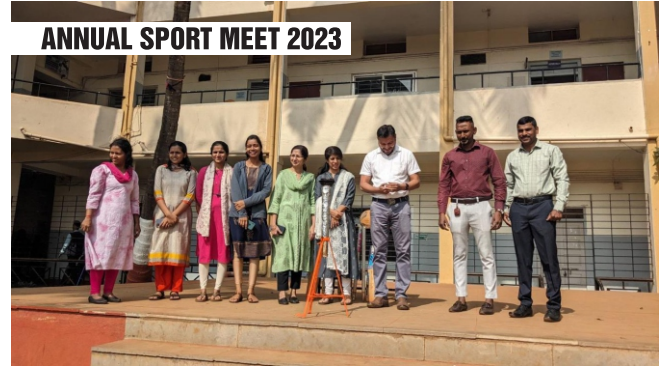
ANNUAL SPORT MEET 2023