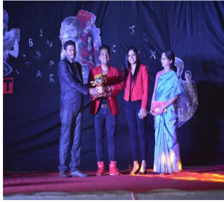
STUDENTS CABINET 2023