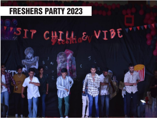
FRESHERS PARTY 2023